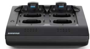
MXWNCS4 Networked Charging Station