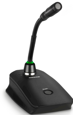
MXW8 Gooseneck Base Transmitter