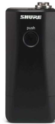
MXW1 Bodypack Transmitter