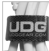
Includes UDG Velcro strap for easy storage