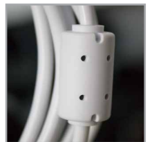
Two ferrite chokes: help eliminate noise in both directions