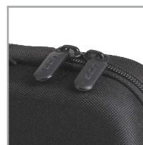
Easy grip zipper pulls