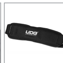
Convenient shoulder strap