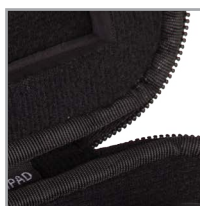
Durashock molded EVA foam