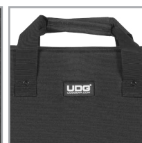
Convenient carry handles