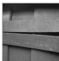
Includes adjustable foam pads