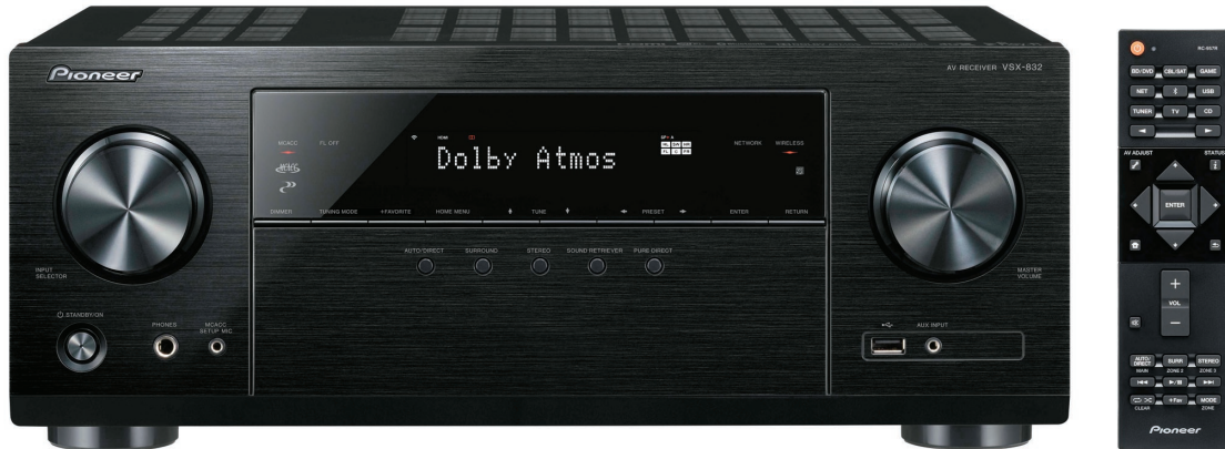
* Image after Dolby Atmos firmware update Silver model also available in Europe

Upgrade your home entertainment to the next level with Pioneer's VSX-832, the first 5ch AV receiver supporting Dolby Atmos®. Enjoy a wide, enveloping soundscape with the Surround Enhancer. Ultra HD video, HDR10, HLG (Hybrid Log-Gamma), and Dolby Vision™ present life-like images, while FlareConnect™, Chromecast built-in, and DTS Play-Fi® let you stream music anywhere in the house. Limitless songs on internet radio and network streaming services are just a few taps away with the Pioneer Remote App.